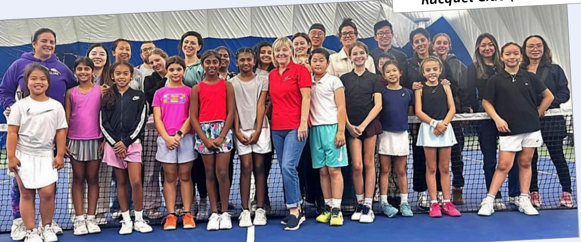
Councillor's Cup Tournament at Premier Racquet Club (PRC)

Many properties have a city-planted tree located on the boulevard. To help keep these trees healthy and growing, please do not place bricks, stones, pavers or other landscaping materials around the base of the tree. These items can damage tree roots and restrict proper growth. If these materials are installed around a boulevard tree, the city's By-law Officers may request that they be removed. Keeping the area around the tree clear helps to protect this important neighbourhood tree canopy, and ensures the trees can continue to thrive for years to come.