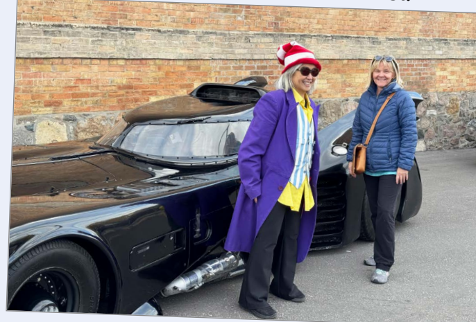
Halloween & the Batmobile on Main St.

If you are a homeowner or business owner planning to demolish, construct, renovate or change the use of a building, it is important to make sure you are constructing in accordance with the Ontario Building Code. Building permits are required before proceeding with any construction or home renovation projects. To learn more about the types of permits and what is required, please visit our Markham website or contact Building Standards at 905.475.4858