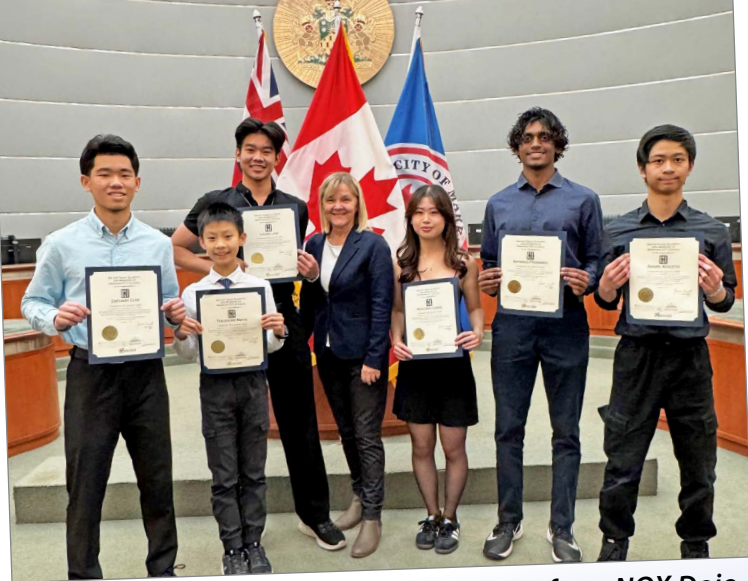
Community Recognition Night – Students from NOX Dojo