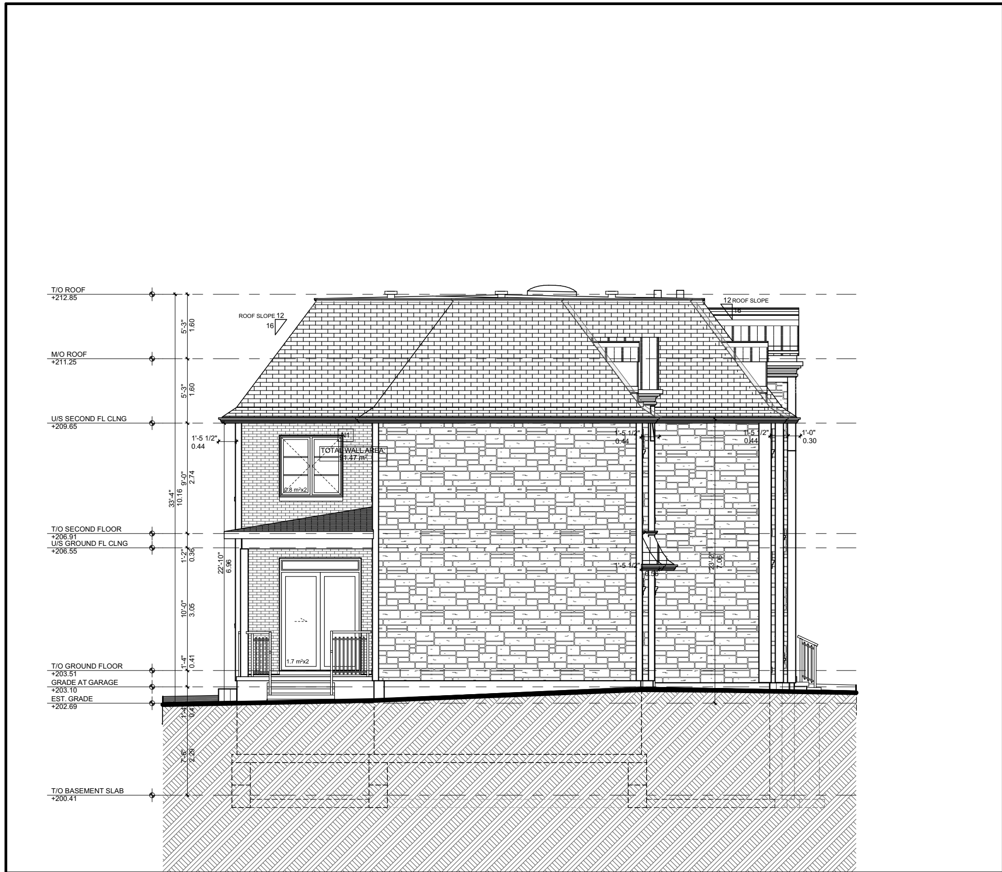
1 NORTH ELEVATION A3.4 SCALE: 1/8" = 1'-0"