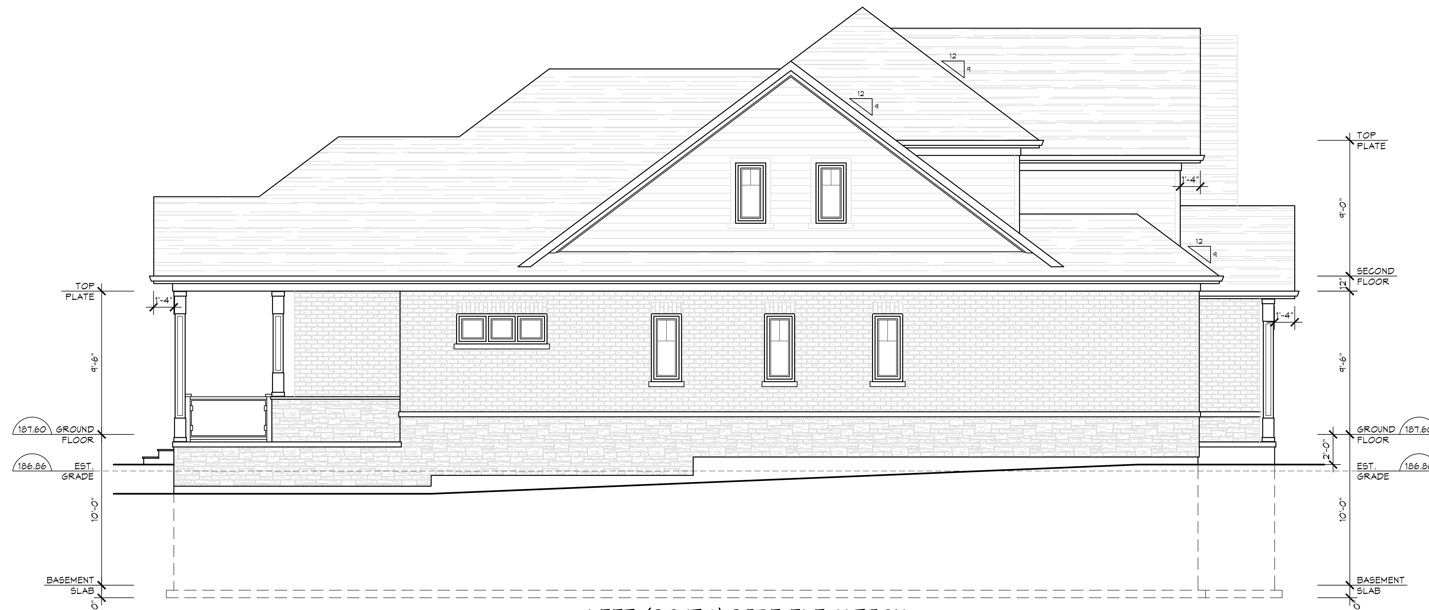
LEFT (SOUTH) SIDE ELEVATION